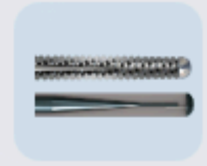
SAVION DLVR™ Wire SAVION FLX™ Wire