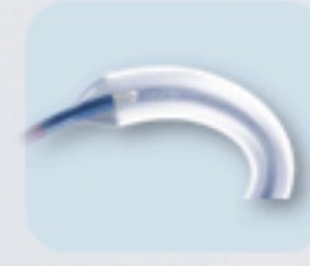
Ranger™ Drug-coated Balloon