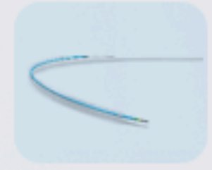
Coyote™ Balloon Catheter