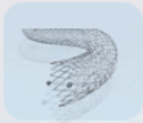
Innova™ Stent System