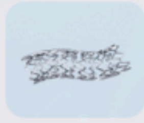
Express® SD Renal Stent System