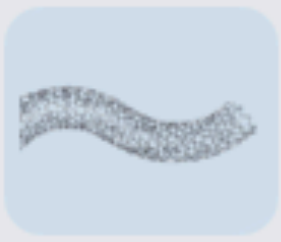
Express® LD Iliac Stent System