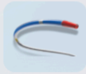
OptiCross™ 18 IVUS Catheter