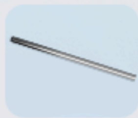
V-18™ .018 Guidewire