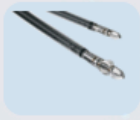
Jetstream™ Atherectomy System