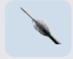
Rotablator™ Rotational Atherectomy