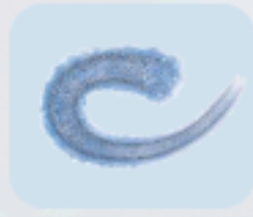
Eluvia™ Drug-eluting Vascular Stent System